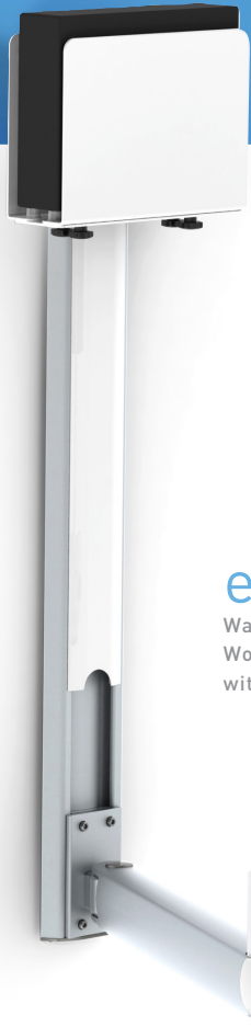
e997 Wall Arm EHR Workstations with eDesk